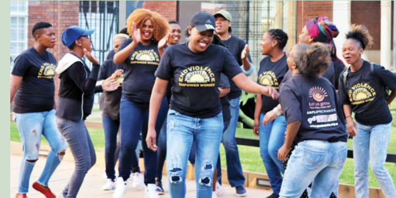
Let us grow choir celebrating the launch of Women's Voice and Leadership in South Africa.

A fund to ensure the increased enjoyment of human rights by women and girls, and the advancement of gender equality in South Africa.